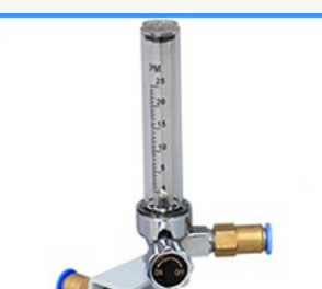
Nitrogen valve (Model: HN2-01)

Data logging humidity and temperature, can read and output data by software with a PC