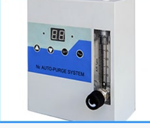
Independent Nitrogen purge system (Model TN2-02)

Allows grounding while handling ESD sensitive materials