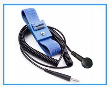
♦Wrist strap connection

Alarm light flashes and sounds when its internal humidity exceeds set value