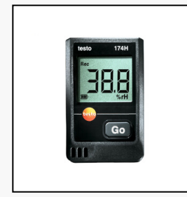
Data logger with software (model 174H)

Effective usage of N<sub>2</sub> combined with Super Dry, help to accelerate the recovery time and oxidation prevention. Set the buttons on N2 purge system itself