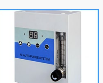
❖Independent Nitrogen purge system (Model TN2-02)

Greatly increase the usable space inside Super Dry