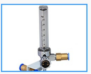
❖Nitrogen valve (Model: HN2-01)

Suitable for storage of components on tape and reel, can pull out on rail