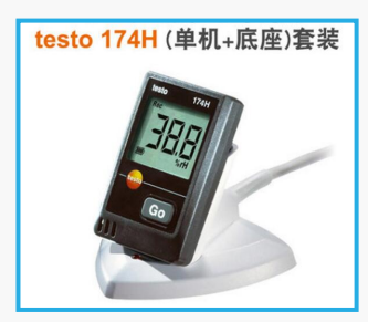
❖Data logger with software (model MR6662)

Suitable for storage of components on tape and reel, can pull out on rail