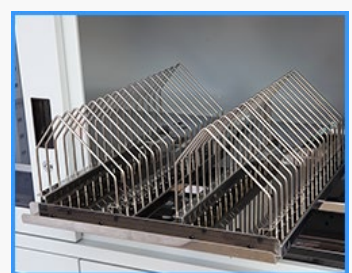
❖SMD double rack (stainless steel)

Suitable for storage of components on tape and reel, can pull out on rail