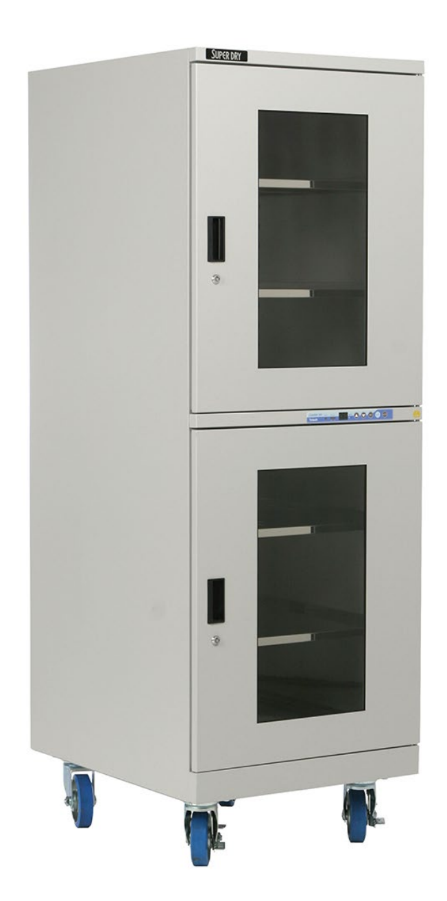
CSD-702-03 has an outstanding performance for drying moisture sensitive components and PCBs as a result of a high performance drying unit. Humidity can be controlled precisely by digital panel to reach the lowest <3%RH. It is specially designed for moisture sensitive SMD packages to comply with IPC/JEDEC J-STD-033D.

Totech (Toyo Living) is the creator of world's first Automatic Drying System invented in 1973.