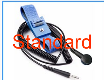
❖Wrist strap connection

Alarm light flashes and sounds when its internal humidity exceeds set value