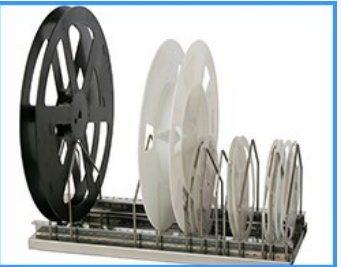
♦SMD single rack (stainless steel)

Effective usage of N<sub>2</sub> combined with Super Dry, help to accelerate the recovery time and oxidation prevention. Set the buttons on N2 purge system itself