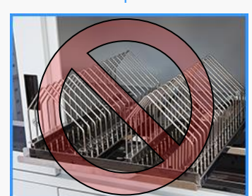
❖SMD double rack (stainless steel)

Suitable for storage of components on tape and reel, can pull out on rail