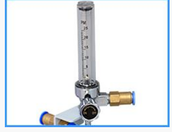
❖Nitrogen valve (Model: HN2-01)

Effective usage of N<sub>2</sub> combined with Super Dry, help to accelerate the recovery time and oxidation prevention. Set the buttons on N2 purge system itself