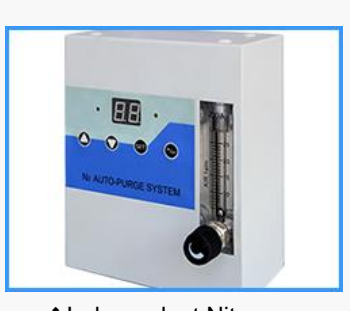
❖Independent Nitrogen purge system (Model TN2-02)

Alarm light flashes and sounds when its internal humidity exceeds set value