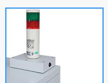
Humidity alarm light

Alarm buzzer sounds when its internal humidity/ door open time exceeds set value