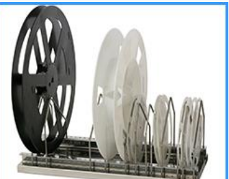
❖SMD single rack (stainless steel)

Greatly increase the usable space inside Super Dry