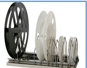
♦SMD single rack (stainless steel)

Greatly increase the usable space inside Super Dry