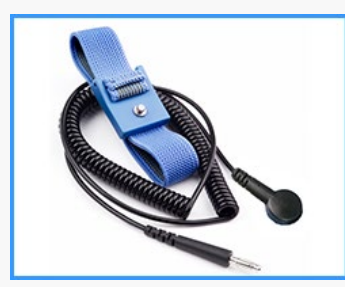
❖Wrist strap connection

Effective usage of N<sub>2</sub> combined with Super Dry, help to accelerate the recovery time and oxidation prevention. Set the buttons