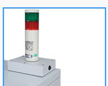
❖Humidity alarm light

Alarm buzzer sounds when its internal humidity/ door open time exceeds set value