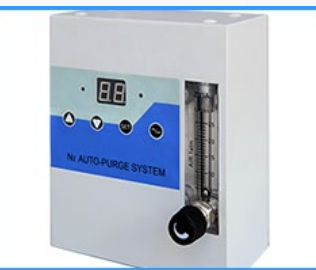
purge system (Model TN2-02)

Alarm light flashes and sounds when its internal humidity exceeds set value