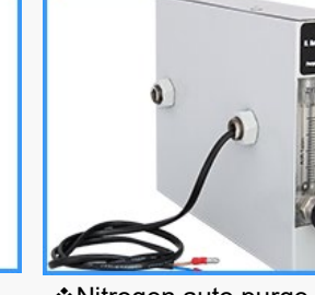
❖Nitrogen auto purge system (Model AN2-03)