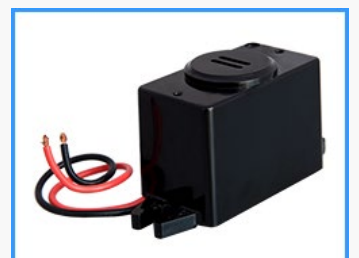
❖Humidity/ Door open alarm buzzer

Suitable for storage of components on tape and reel, can pull out on rail