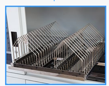
❖SMD double rack (stainless steel)

Suitable for storage of components on tape and reel, can pull out on rail