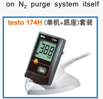
❖Data logger with software (model 174H)

Effective usage of N<sub>2</sub> combined with Super Dry, help to accelerate the recovery time and oxidation prevention. Set the buttons